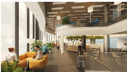
Image 2 caption: The bar area provides informal meeting spaces, full of natural light and with views out towards the city.

Image 1 caption: The three-storey living green wall in the reception of Legal & General’s new Cardiff office gives the instant ‘wow’ factor as well as contributing to sustainability and air quality.