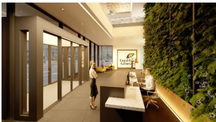
Image 1 caption: The three-storey living green wall in the reception of Legal & General’s new Cardiff office gives the instant ‘wow’ factor as well as contributing to sustainability and air quality.

High quality images are available to download here .